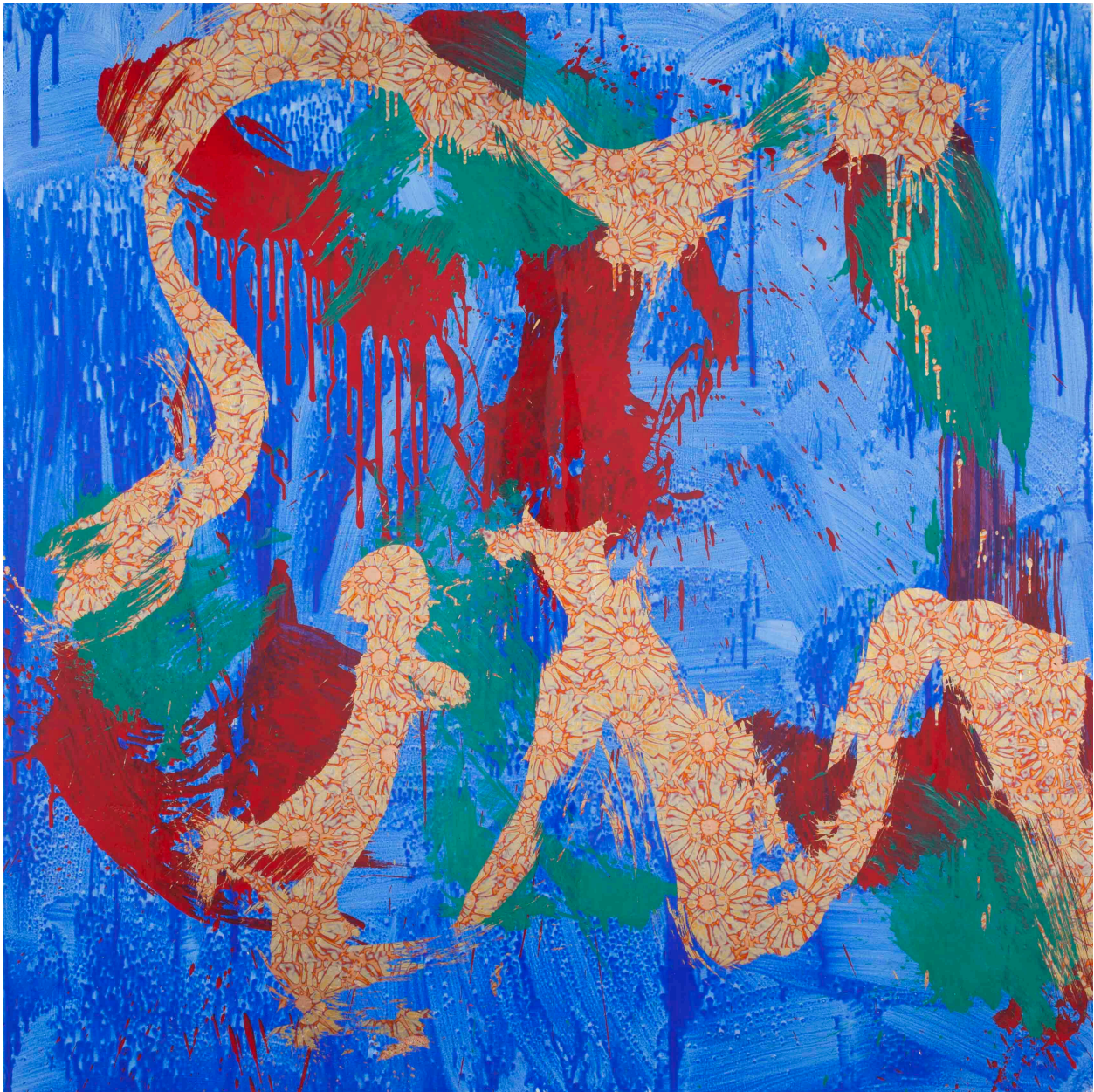
Love Conquers All , 2013, gesso, acrylic & vinyl polymers, epoxy, aqua size, blue variegated metal leaf on canvas, 177.8 x 177.8 x 5 cm.