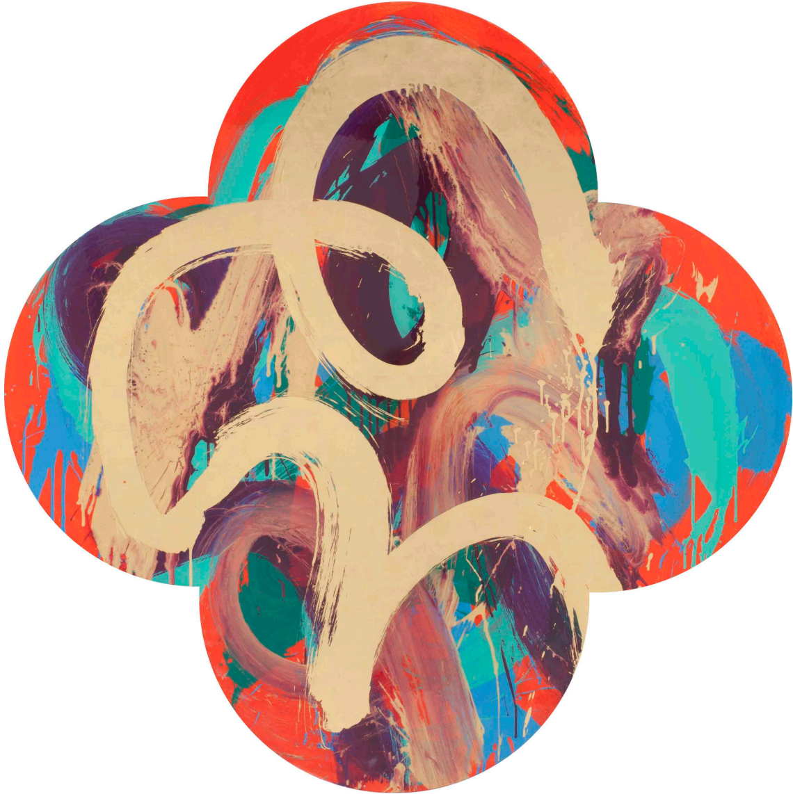
Jungle Throne , 2014, gesso, acrylic & vinyl polymers, resin, water-based size, 23.75kt gold leaf on canvas, 152.4 x 152.4 x 5 cm.

Courtesy the artist and Kashya Hildebrand, London.