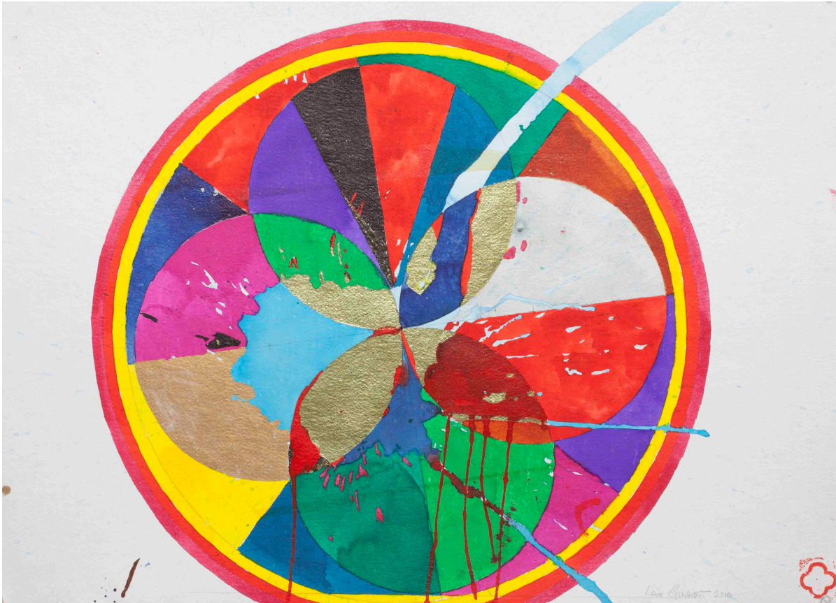
Blue Break , 2010, pencil, ink, acrylic polymer, oil size, Japanese olive green coloured silver leaf on St. Armand handmade paper, 54.6 x 74.9 cm.