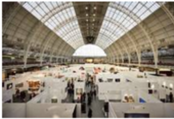
Art13 London Installation View

In art fair terms "international" generally means the major America and Northern European cities with a smattering of spaces from Latin America and the Middle and Far East; but the 182 galleries brought together under Olympia's vast steel and glass canopy this weekend have a genuinely broad reach, hailing from 42 different countries, with many – including Pakistan, Indonesia, Taiwan, Mali, and Lithuania – notably absent from the regular art world roster.