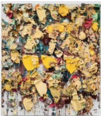
Zhu Jinshi, Yellow Magnolia Spread on the Floor, 2013

Good news for collectors of more modest means is that Dieckvoss's notion of diversity also extends through to the range – and cost – of artworks on display, as well as to their varied countries of origin. "Many of the leading art fairs now seem to be so high-end and exclusive that what you might call "normal" collectors don't feel they can take part any more – and that's a big shame," she states, citing Art14 exhibitors such as Edge of Arabia's Projects studio, which commissions and publishes contemporary Middle Eastern art in limited edition prints. "What we have on show can range from affordable prints through to photography through to huge, very difficult